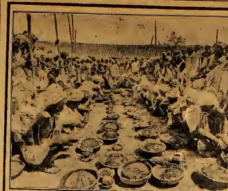
At the District Working Place.